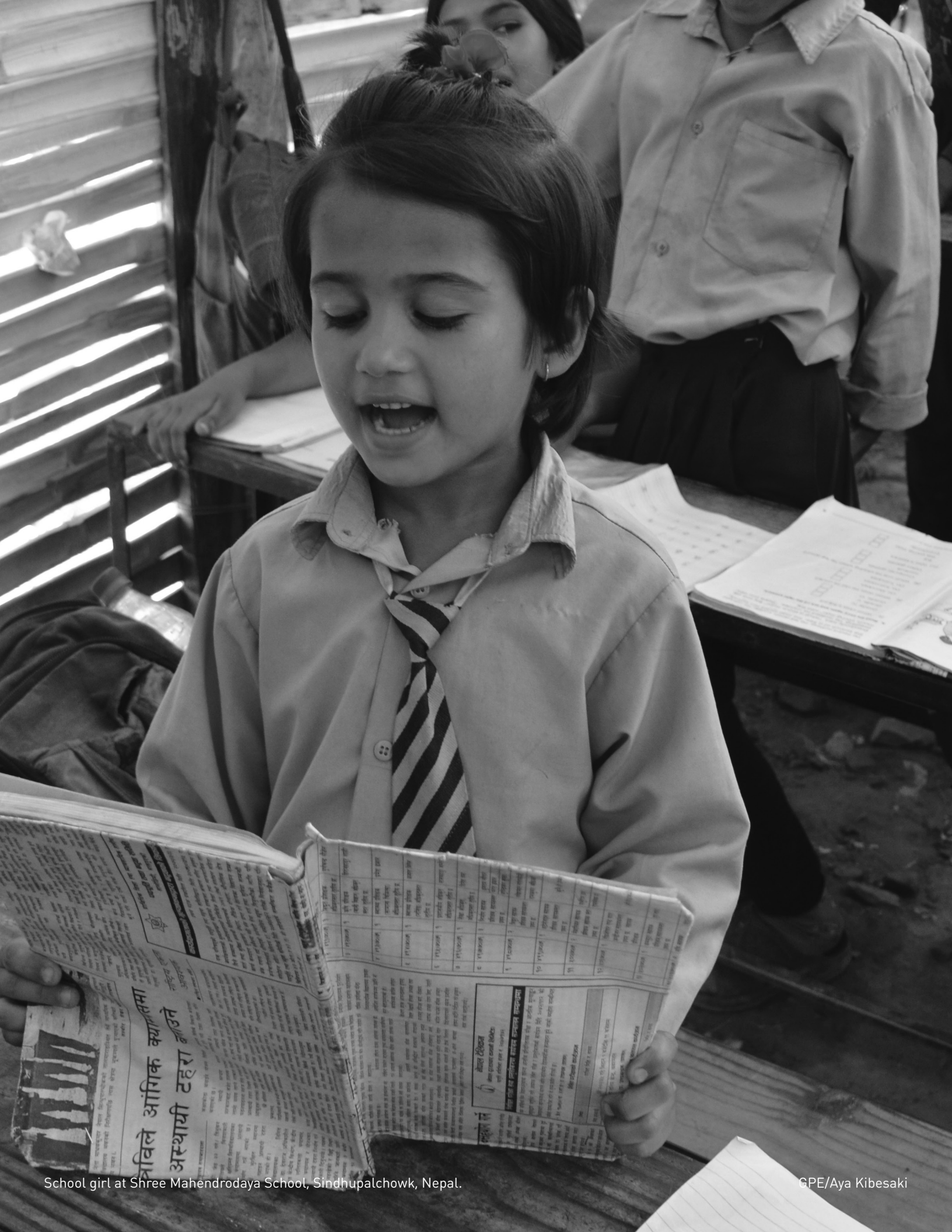
School girl at Shree Mahendrodaya School, Sindhupalchowk, Nepal.