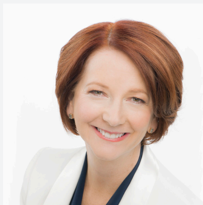
JULIA GILLARD Chair of the Board of Directors