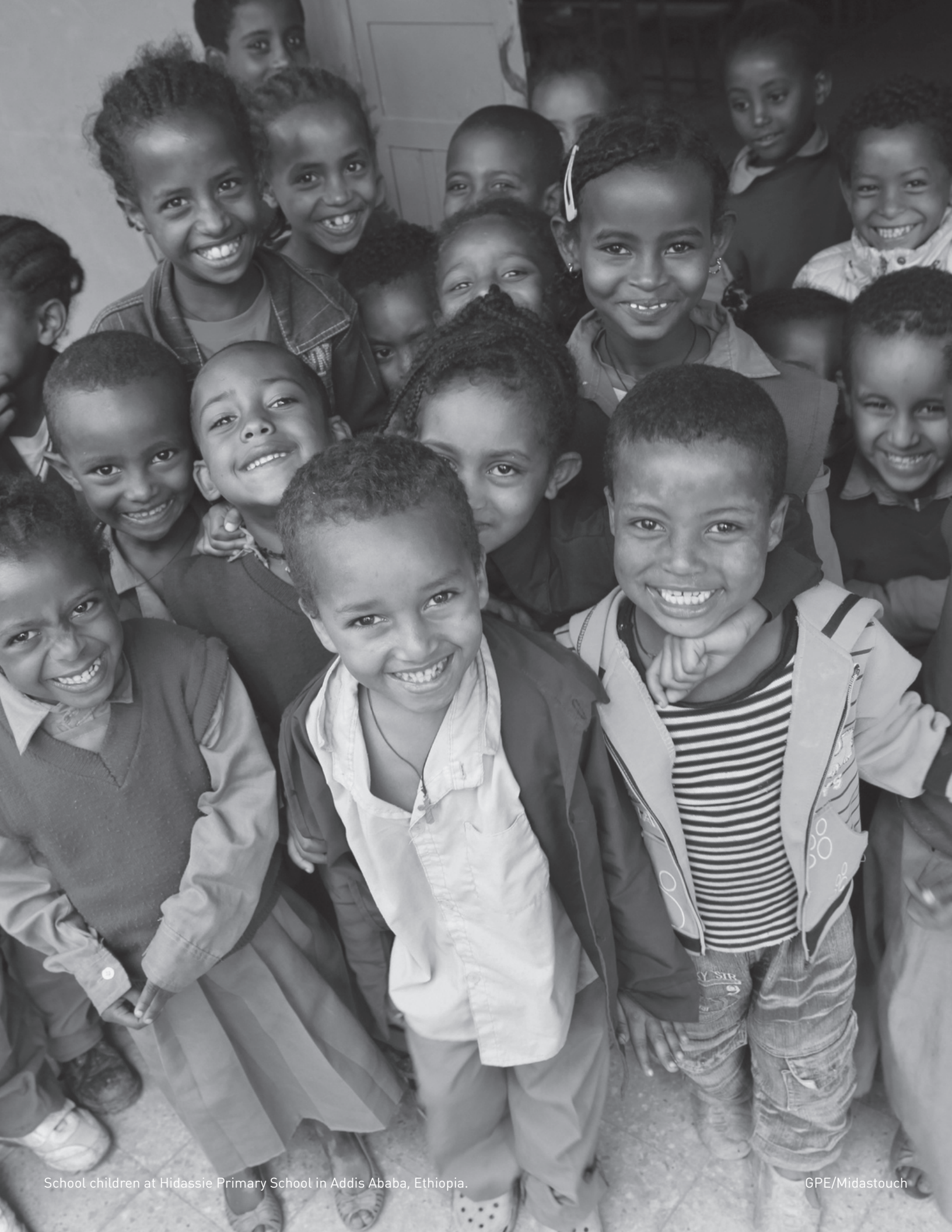
School children at Hidassie Primary School in Addis Ababa, Ethiopia.