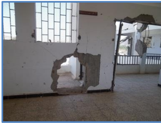
In Sa'ada, all assessed schools had damages to their interior and exterior structures due to conflicts

Based on the severity of need and accessibility of affected schools, the following list of schools was prioritized: