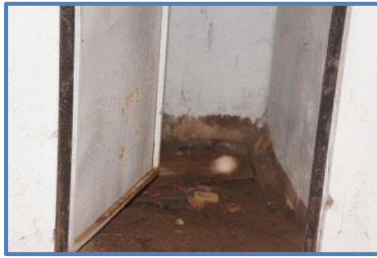
Schools that had been used by internally displaced persons (IDPs) in Lahj and Aden were left with damaged furniture and unusable latrines