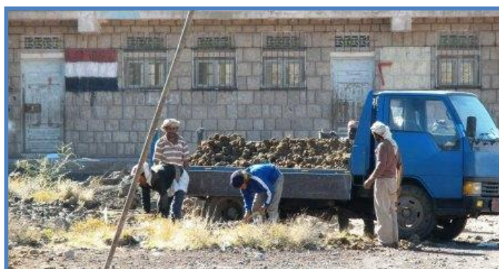
A closed school was rehabilitated to receive students

Despite challenges, UNICEF and partners have been able to complete the rehabilitation of all targeted schools while ensuring that children continue to have access to learning spaces.