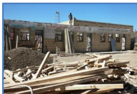
The roof had to be replaced in this school in Arhab, Sana'a

Rehabilitation of 122 schools began in October, 2013, while the remaining 17 schools faced delays. Out of these, four schools were in the Damaj area of Sa'ada Governorate where new fighting erupted and therefore hindered access, so rehabilitation work could not begin until February 2014. The other 13 were received by the two local NGOs mentioned earlier after passing through UNICEF's capacity assessment and finalizing all legal procedures and setting up adequate monitoring and reporting arrangements.