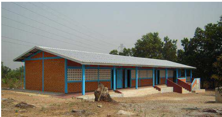
“Ecole Temoin”- a model school constructed with UNICEF regular programme funds in late 2010 in the outskirts of Conakry